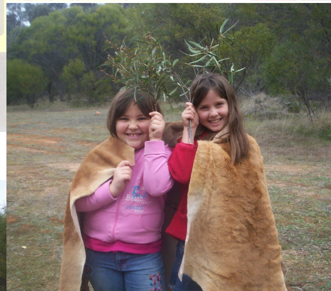
Cross- Cultural Awareness