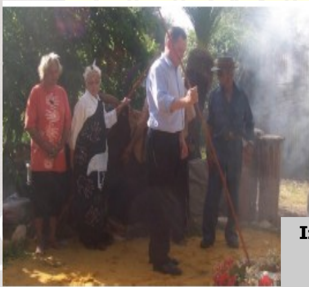
Indigenous Heritage Consultation