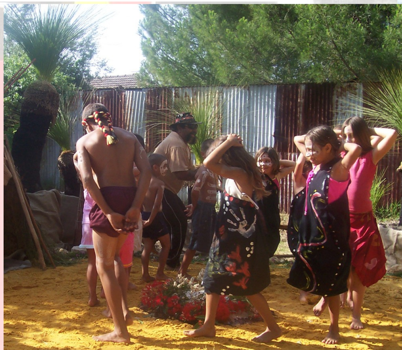
Indigenous Heritage Education