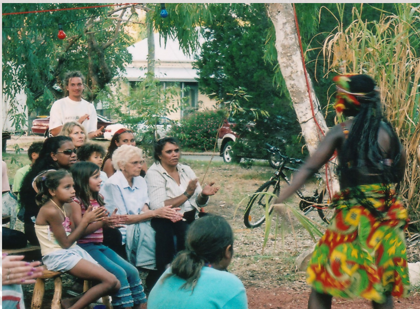
Multicultural Activities at Mandjah Boodjah on Harmony Day