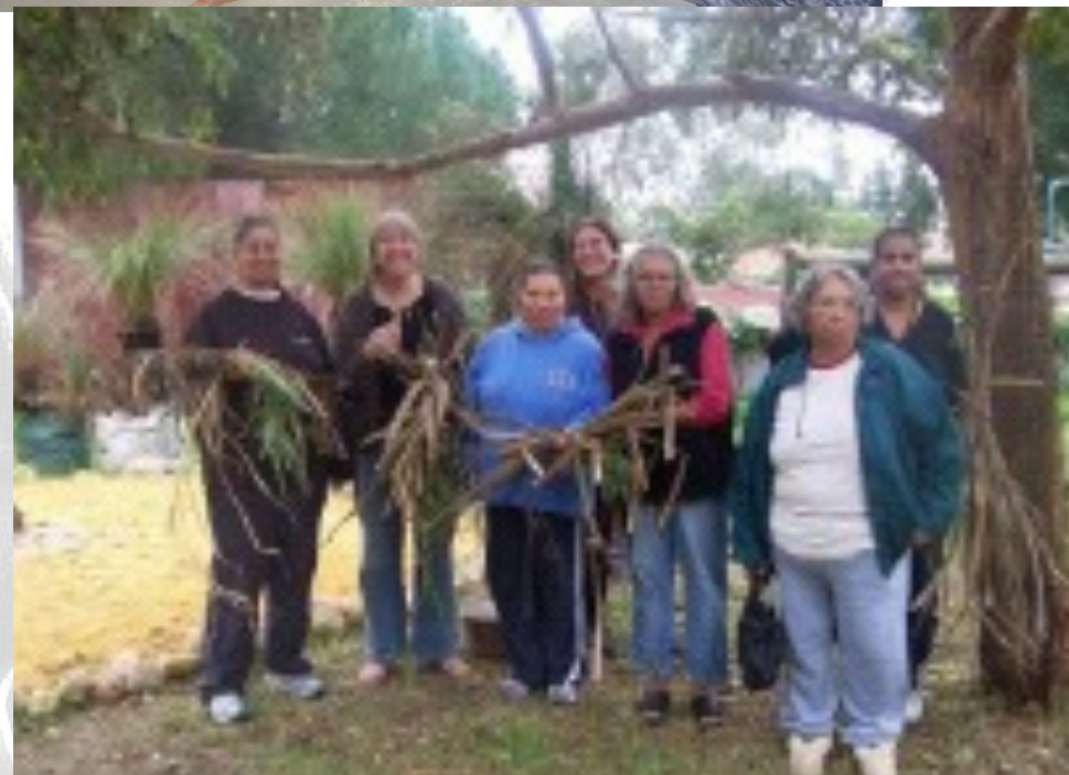
Indigenous and other senior women gather plants for weaving traditional carry bags