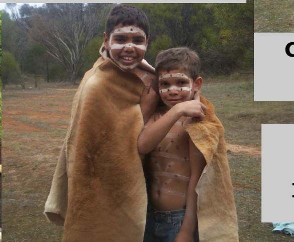
Capacity Development Management and Training